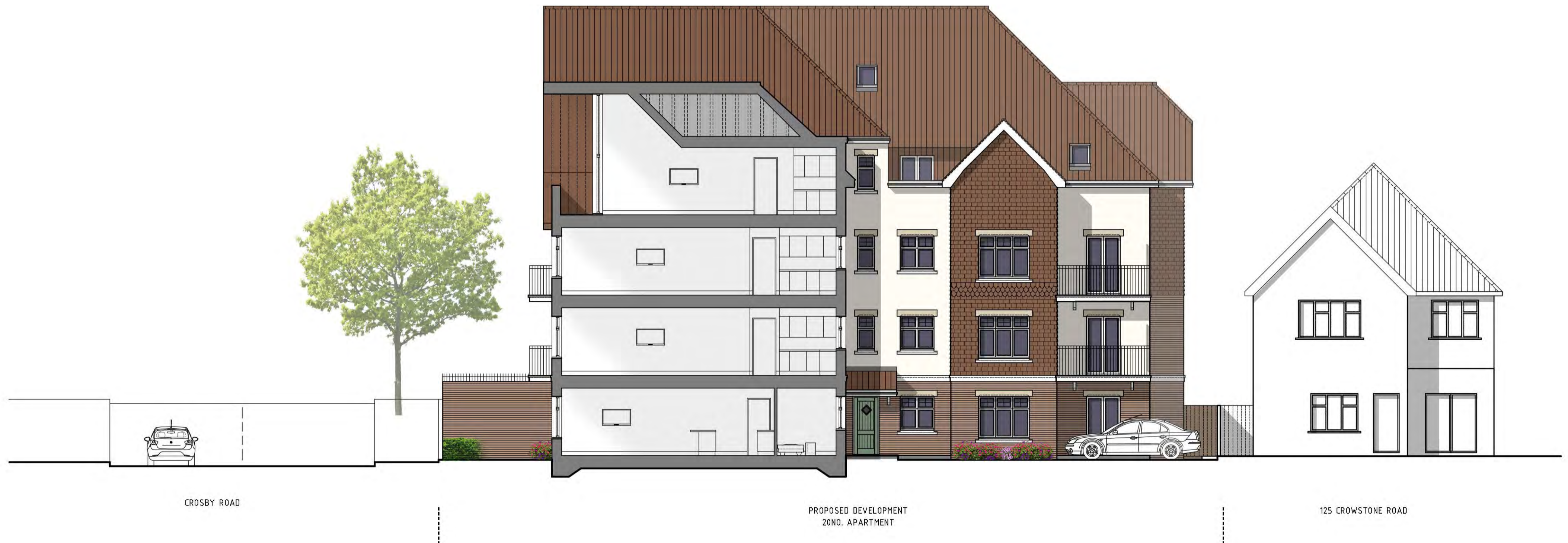
AS PROPOSED: SECTION A-A, (ALONG CROSBY ROAD)

This drawing is to be read in conjunction with all Architect's drawings, schedules and specifications, and all relevant consultants and/or specialists' information relating to the project. Refer all discrepancies to DAP Architecture Ltd.